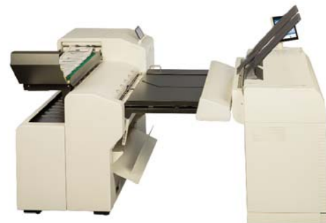
KIP 7570 print system & optional KIPFold 2800 online fan & cross folder