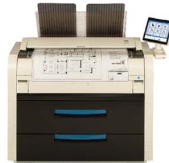
KIP 7580 multi-function system with integrated CIS scanner & top stacking print tray