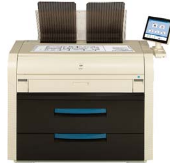
KIP 7570 network print system with integrated top stacking print tray

KIP cloud connectivity enables productive printing access anytime, anywhere. The KIP 7570 network print system makes working smarter easy for small or large workgroups. The Perfect View adjustable KIP smart multi-touchscreen offers intuitive printing directly from a variety of network resources, cloud connections, removable media, local mailboxes and historical queue; you don't have to leave the printer to perform important tasks. Easily upgrade the KIP 7570 to a multi-function print system.