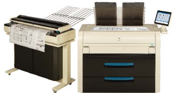
KIP 7590 MFP system with KIP 2300 CCD production scanner