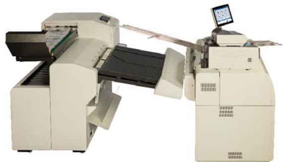
KIP 7990 production system with KIP 2300 scanner & optional KIPFold 2800 online fan & cross folder